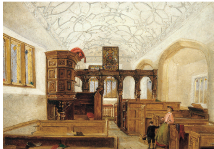
St Peter, North Newton.