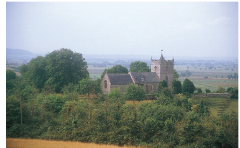
Blessed Virgin Mary, Moorlinch.